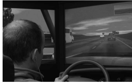
Figure 2. High-fidelity driving simulator.

In each of the three experiments, a Patrol-Sim fixed-base driving simulator, manufactured by GE I-Sim ( www.i-sim.com ), was used (Figure 2). The simulator recreated a realistic driving environment. The dashboard instrumentation, steering wheel, and gas and brake pedals were taken from a typical sedan with an automatic