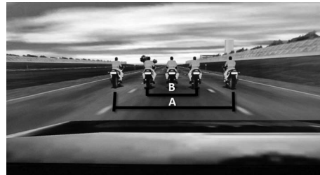
Figure 3. (A) Outer motorcycles are approximately 17^\circ apart. (B) Inner motorcycles are approximately 7^\circ apart. Participants sat approximately 90 cm from the screen.

transmission. Three 5-min driving scenarios were used. Each scenario consisted of a straight, three-lane, divided highway. In Experiment 1, the scenarios contained three motorcycles that proceeded 22 m ahead of the participant vehicle, side by side in the middle lane, at a constant speed of 65 mph. In Experiments 2 and 3, the scenarios contained five motorcycles that proceeded 22 m ahead of the participant vehicle, side by side in the middle and outer lanes, at a constant speed of 65 mph. Each of the motorcycles had a white license plate illuminated by two adjacent red lights. Only one license plate was illuminated at a time, and participants were instructed to always look at the illuminated license plate as they drove (Figure 3).