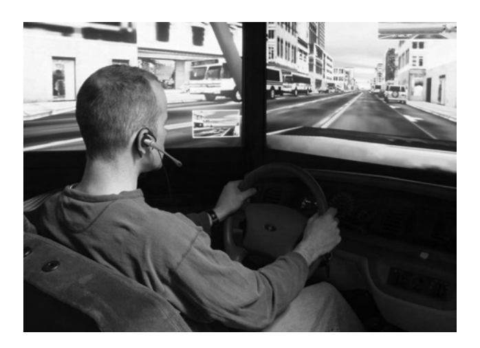
Figure 2. Participant talking on a cell phone in the I-Sim driving simulator.

To determine who initiated the reference to traffic, we analyzed the number of initializations made in the cell phone conversation