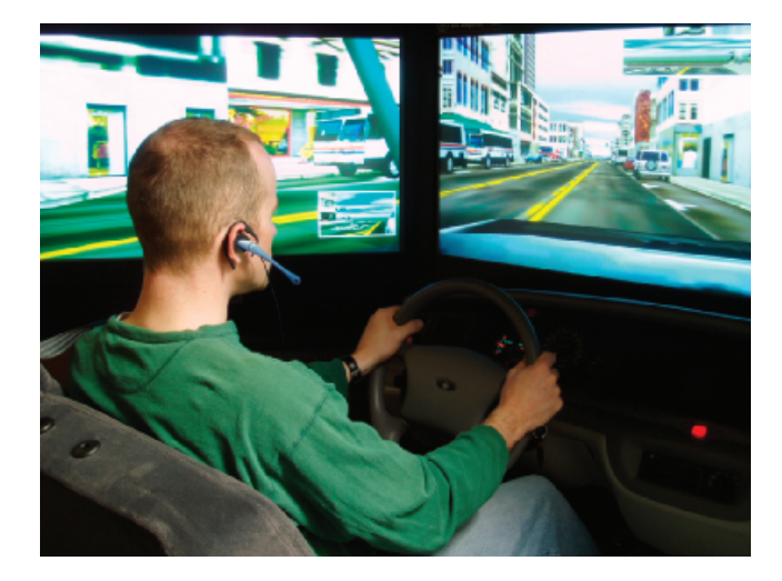
Fig. 1. A participant talking on a hands-free cell phone while driving in the simulator.

traffic-scenario, and road-surface software to provide realistic scenes and traffic conditions. We monitored the eye fixations of participants using a video-based eye-tracker (Applied Science Laboratories Model 501) that allows a free range of head and eye movements, thereby affording naturalistic viewing conditions for participants as they negotiated the driving environment.